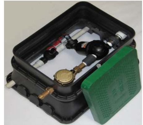
Wash Down Filters WD Series

Wash Down Filter Systems automatically remove contaminants from the surface of the filter, substantially increasing the time between service events in secondary effluent dispersal systems.